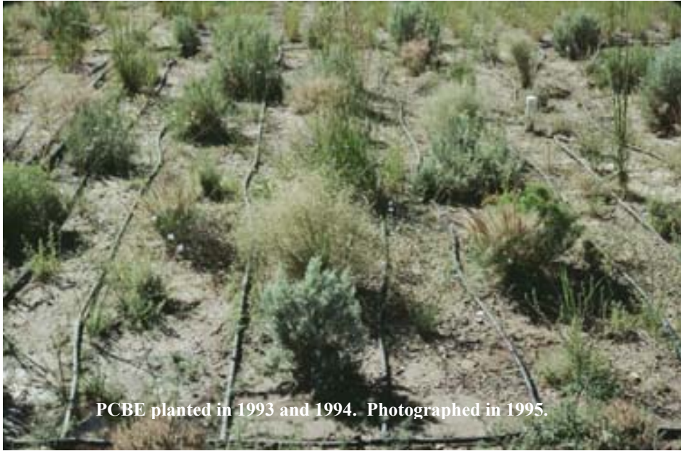
PCBE planted in 1993 and 1994. Photographed in 1995.