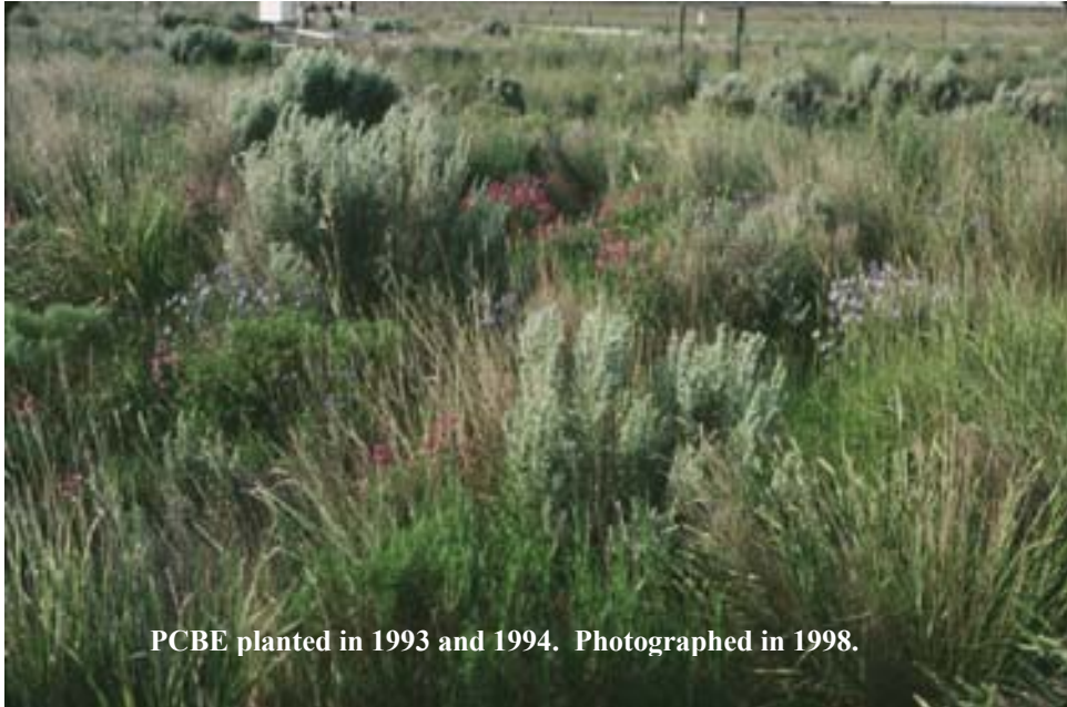
PCBE planted in 1993 and 1994. Photographed in 1998.